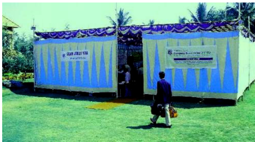
Arrival of delegates to the venue

Report was published in the newsletter. As informed in the newsletter, this is the photo edition.